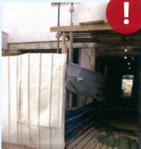
Improper fencing, lack of signage

You can prevent the next accident too! Have you noticed any risks?