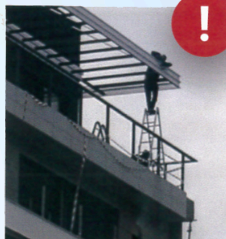
Unsafe work on a ladder