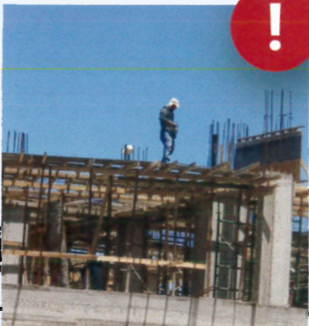
Working at heights is life-threatening