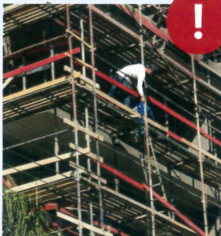
Working without personal protective equipment