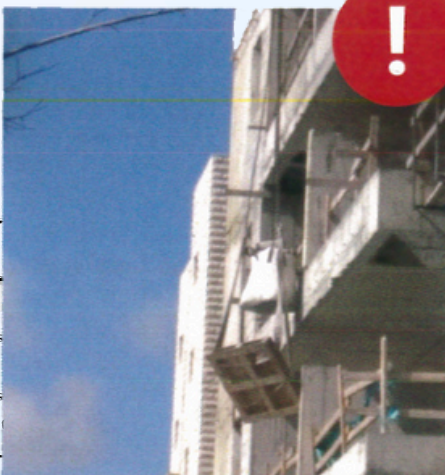
Prohibited and life- threatening equipment lifting